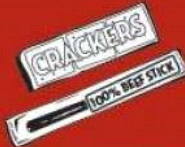
DISPOSABLE SNACK CONTAINERS