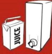
DISPOSABLE BEVERAGE BOXES